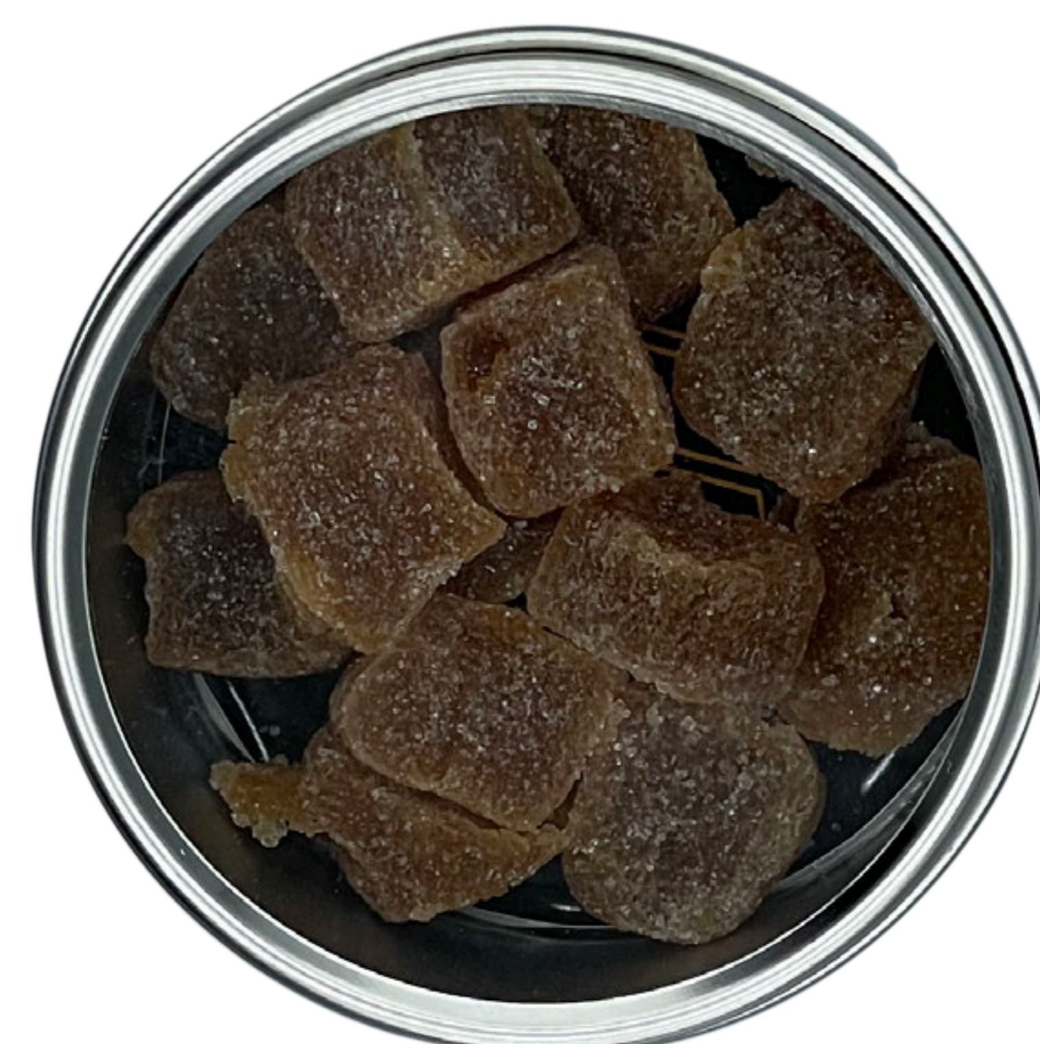
12 Nano Blox