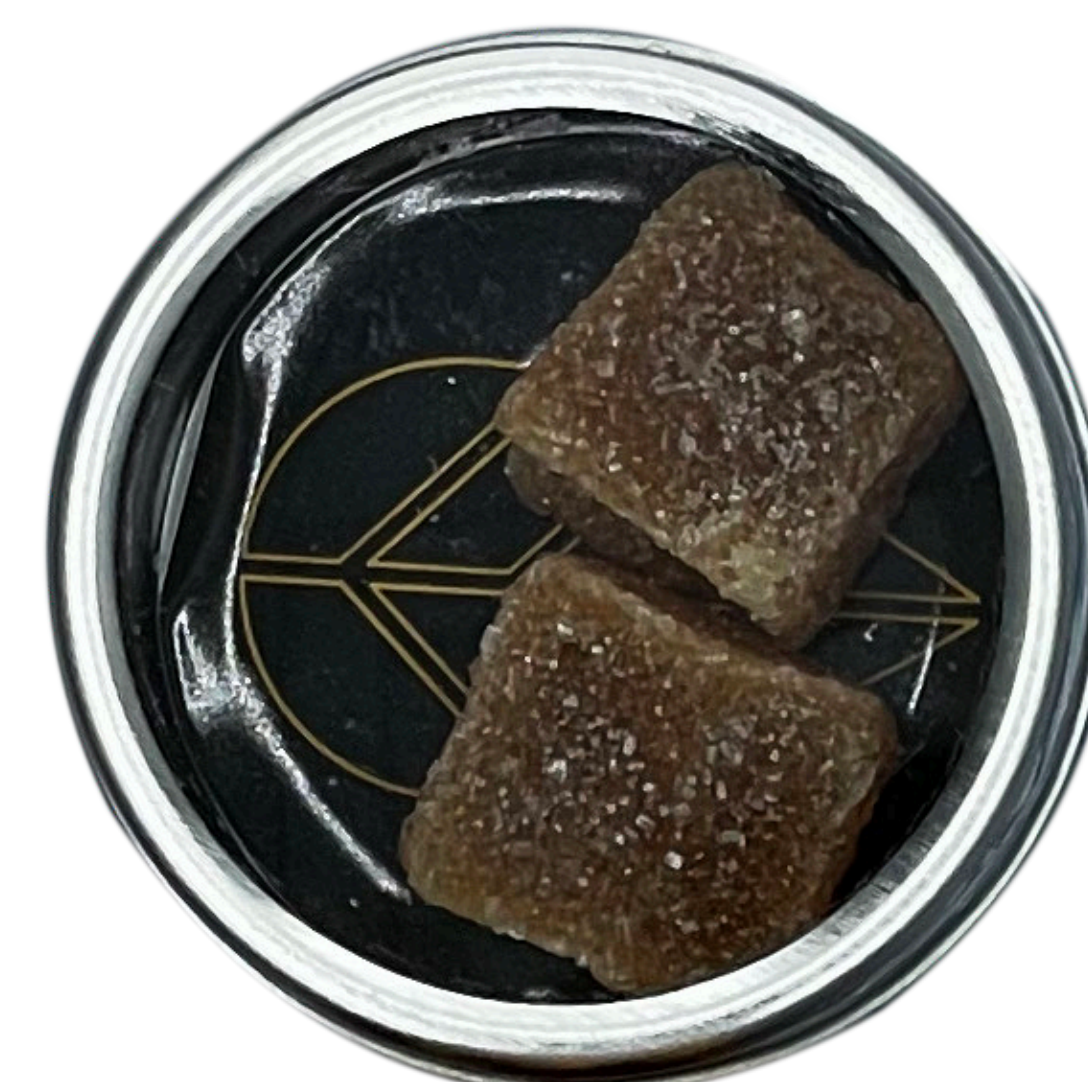
2 Nano Blox