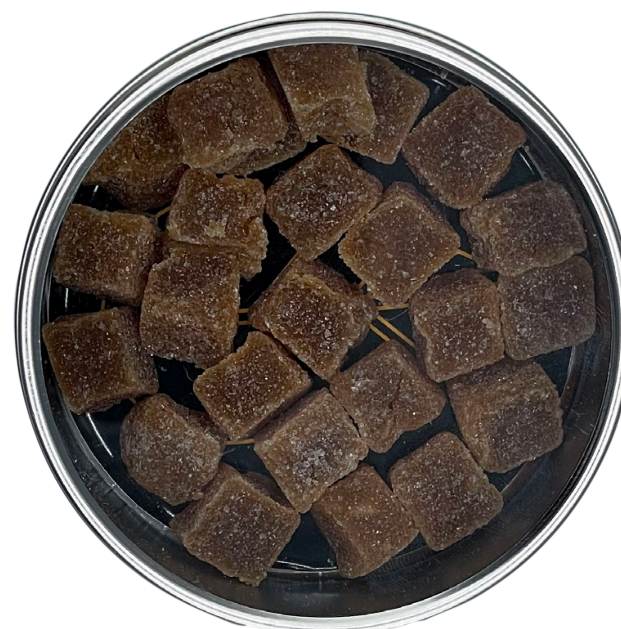
24 Nano Blox